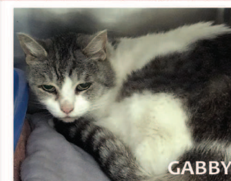
GABBY TABBY Gabby is a med. senior female

Sponsored by Warrenton Fiber 389 NW 13th St. 503-861-3305