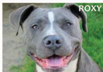
ROXY PIT BULL TERRIER Roxy is a med. adult female

Sponsored by Clatsop Animal Assistance www.dogsncats.org 503-861-0737