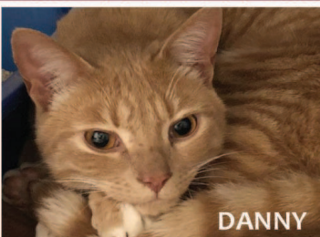
DANNY TABBY Danny is a med. young male

Sponsored by Bay Breeze Boarding & Grooming 1480 SE 9th, Warrenton 503-861-1621