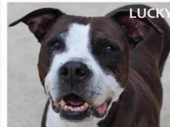
LUCKY PIT BULL TERRIER Lucky is a med. senior female

Sponsored by Hammond Kennels 636 King Salmon, Hammond 503-861-1601