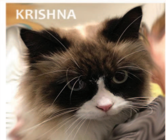
KRISHNA RAGDOLL & HIMALAYAN MIX Krishna is a med. senior male

Sponsored by Clatsop Animal Assistance www.dogsncats.org 503-861-0737