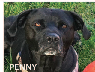
PENNY LAB & PIT BULL MIX Penny is a med. adult female

Sponsored by Area Properties Meagan Lewis 1490 Commercial St., Astoria 503-440-0155