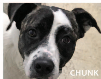
CHUNK POINTER & HOUND MIX Chunk is a med. young male