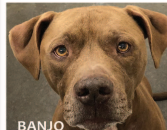
BANJO LAB & PIT BULL MIX Banjo is a med. adult male

Sponsored by The UPS Store 5 N. Hwy. 101, Warrenton 503-861-7447