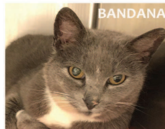
BANDANA TABBY Bandana is a med. sr. female

Sponsored by Classic Bodywerks 34747 Hwy. 101 Bus., Astoria 503-325-0411