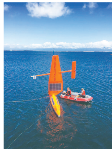
A sailing drone is launched from Neah Bay, Wash., on June 26.

managed by Canada and the United States.