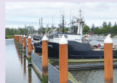
Warrenton's newly rebuilt commercial dock.

Participants should meet at Warrenton Marina's commercial docks, located at the