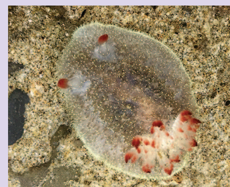
An acanthodoris nanaimoensis nudibranch.