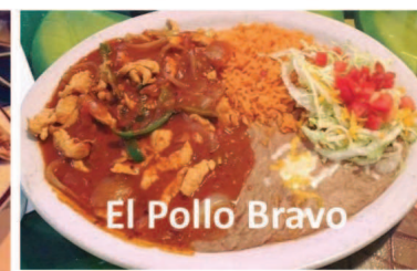
El Pollo Bravo