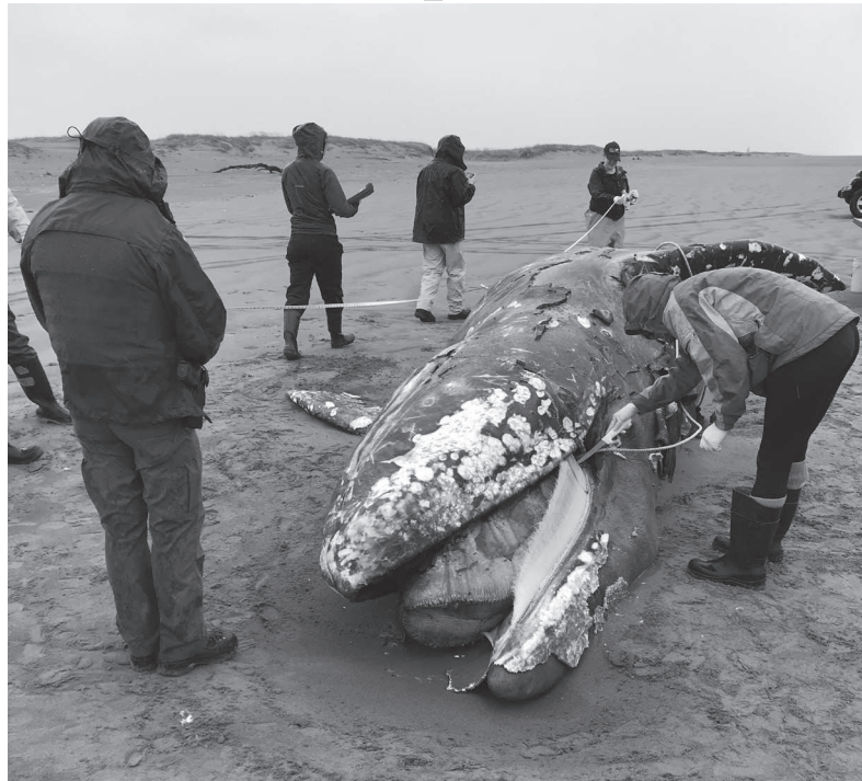
Volunteers work with the gray whale that stranded last week.

The whale stranded on a remote beach at Ledbetter Point and was reported to the West Coast Marine Mammal Stranding Network a week ago. National Oceanic and Atmospheric Administration Fisheries coordinates the network, which is made up of nonprofit and state agencies, biologists and volunteer organizations.