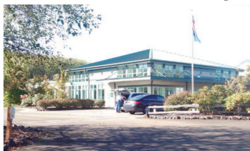
The former Oregon Youth Authority facility would be converted into a 148-bed jail should voters approve a bond measure in November.

The county commissioned the DLR Group architectural firm to evaluate the feasibility