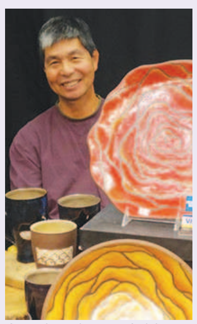
A vendor at last year's fair.

• Seaside Elk's Lodge is sponsoring a Small Business Saturday event with independent consultants selling or demonstrating products, including Dot Dot Smile, LuLaRoe, melaleuca, Norwex, Younique and more. The event is 10 a.m. to 5 p.m. at the lodge, 324 Avenue A.