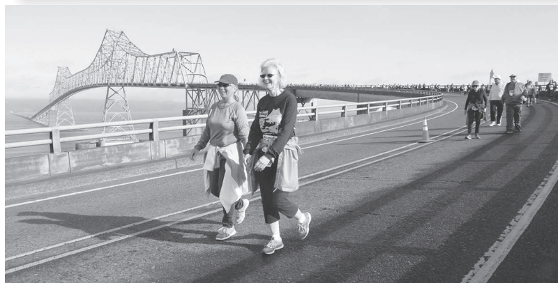
Walkers participating in the 2015 Great Columbia Crossing, the only day of the year the general public is allowed to cross the bridge on foot.