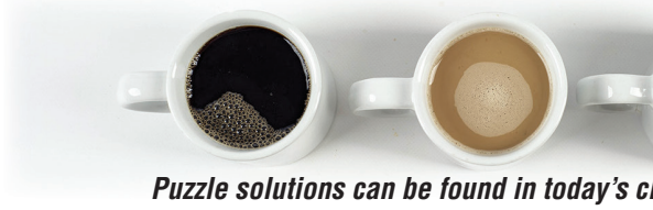
Puzzle solutions can be found in today's classifieds