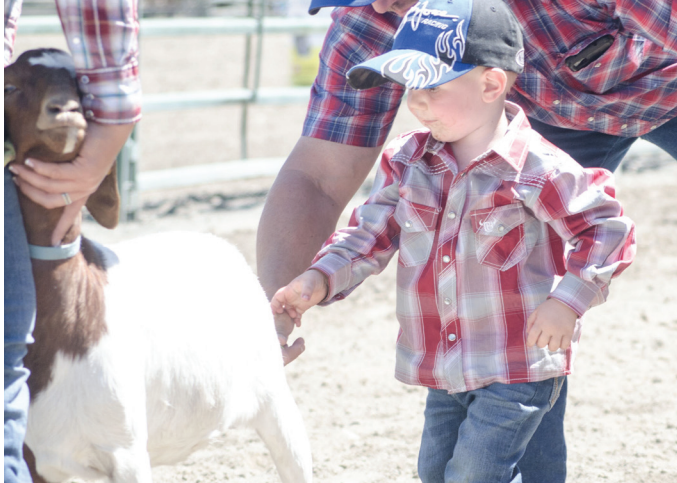
A young fair-goer reaches out to pet a goat.