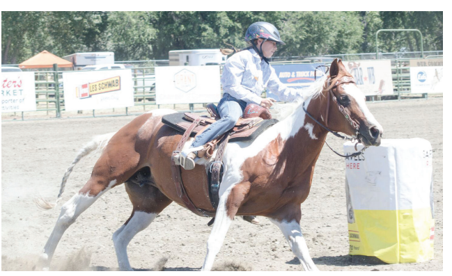
A young competitor rides around the barrels during the Junior