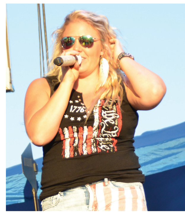
Steven Mitchell/Blue Mountain Eagle