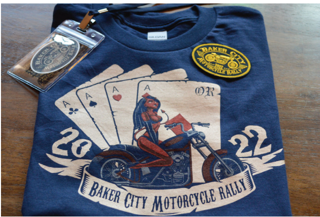
Registrants in the Baker City motorcycle rally will get commemorative gear including a T-shirt, lanyard good for business discounts, a patch, pin and more from Shameless Tees.