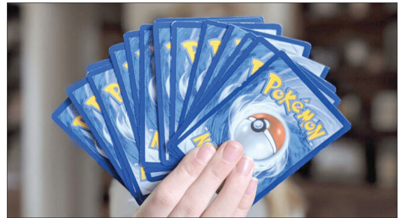
Learn how to play Pokemon in a class at Pendleton Center for the Arts.

TCG stands for "trading card games," which is a fun way to make new friends and share