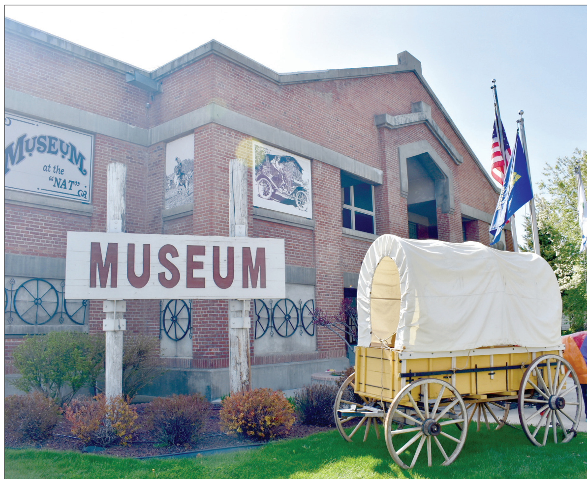
Lisa Britton/Go! Magazine

Panels also outline early efforts to preserve the Oregon Trail, the BLM's role in this pres-