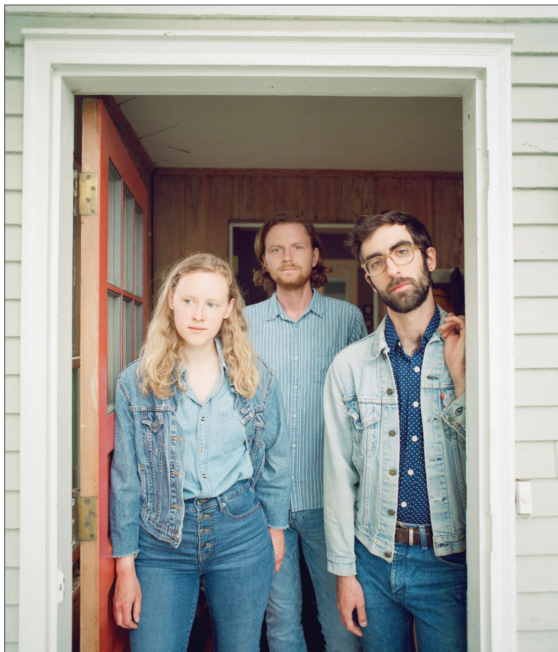
Minnesota-based band Bad Bad Hats playing at Churchill School May 24 in Baker City.

concerts to playing in empty venues to performing at drive-in theaters.