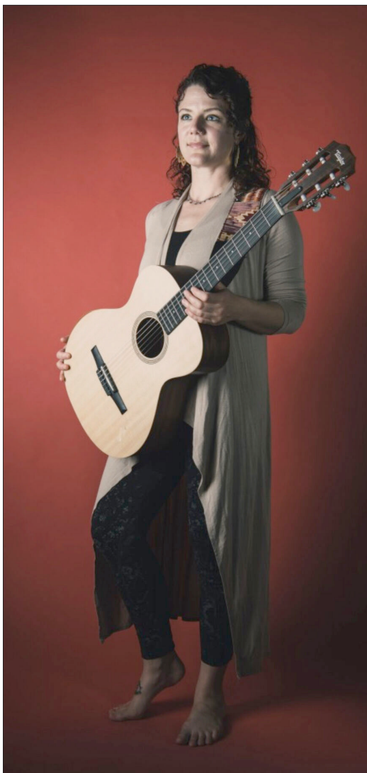
Firefly will play May 13 at Churchill School.