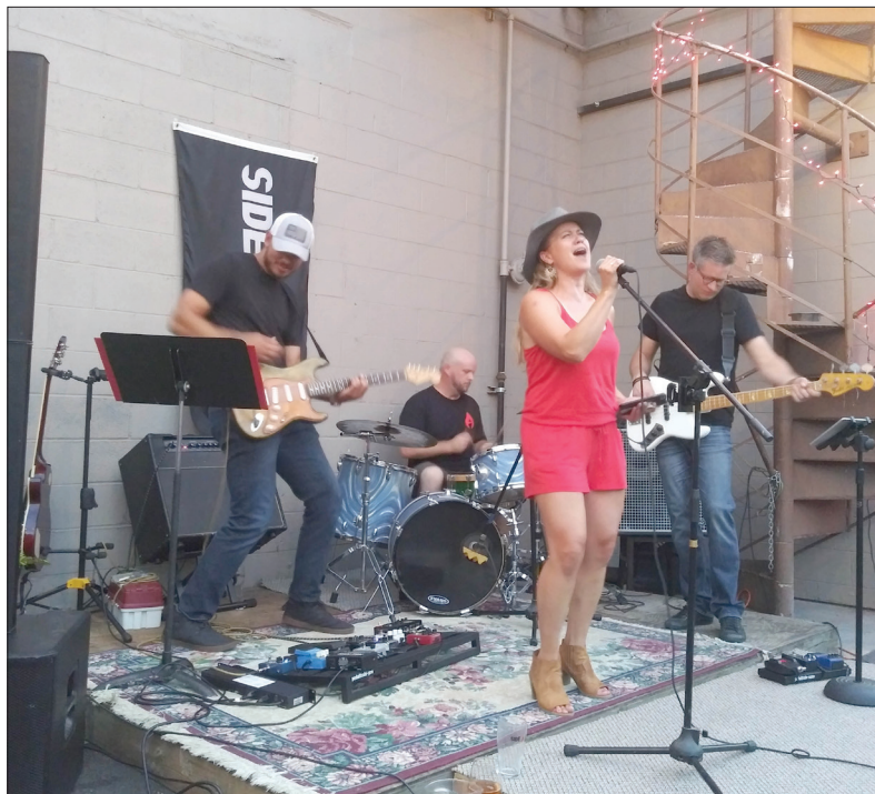
Staci & Co. will play from 5-7 p.m. April 30 at Side A's birthday block party in La Grande.

At the ACE booth, visitors can learn more about art classes, exhibits and memberships. For the "Paint a Pint" project, no painting experience is necessary and all