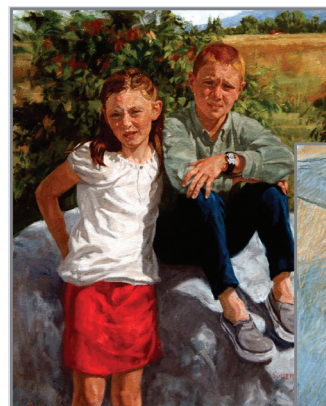
above: Oil, right: Pastel

You can hear the punk-rock sounds all over the album, the power chords and loud riffs. But Lavigne is still very much a pop star in all the best ways. "Bite Me," "Love Sux" and "Love It When You Hate Me" with black-bear lean into the alternative rock vibe, but they still have catchy addictive pop hooks.