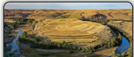
HORSESHOE CURVE HUNTING PROPERTY UMATILLA COUNTY, ECHO, OR 304 +/- acres $3,850,000 RG#02221