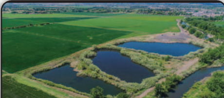
LG RIVERFRONT FARM UNION COUNTY, LAGRANDE, OR 174 +/- acres $1,400,000 RG#00921