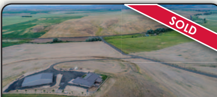
J & K PENDLETON RANCH UMATILLA COUNTY, PENDLETON, OR 161 +/- acres $1,499,000 RG#01121