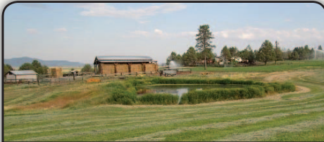
STONE RIDGE RANCH KLAMATH COUNTY, KENO, OR 415 +/- acres $3,200,000 RG#02621