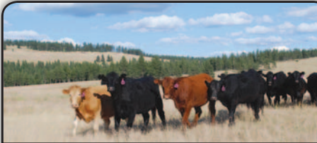
UKIAH RANCH UMATILLA COUNTY, UKIAH, OR 1,494 +/- acres $2,375,000 RG#02521