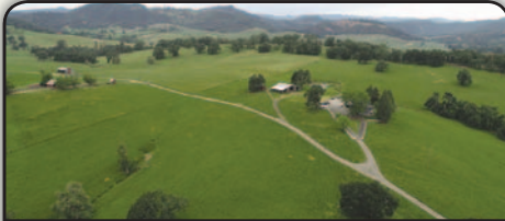
HILLTOP ACRES DOUGLAS COUNTY, WINSTON, OR 387 +/- acres $4,250,000 RG#02317

E-Mail: farms@whitneylandcompany.com • Web Site: www.whitneylandcompany.com