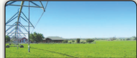
BENSEL ROAD IRRIGATED PROPERTY UMATILLA COUNTY, HERMISTON, OR 38 +/- acres $1,499,000 RG#01821