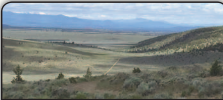
GOLDEN BASIN RANCH DESCHUTES COUNTY, BEND, OR 1998 +/- ACRES $4,100,000 RG#00122