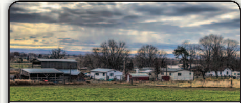
WALKER FARM UMATILLA COUNTY, STANFIELD, OR 67 +/- acres $1,350,000 RG#02620