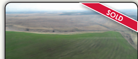
TACHELLA WHEAT FARM UMATILLA COUNTY, PENDLETON, OR 613 +/- acres $1,381,080 RG#00320