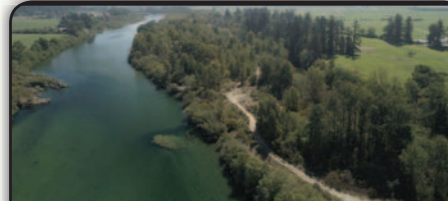
WETHERELL RANCH DEL NORTE COUNTY, CRESCENT CITY, CA 104 +/- acres $1,400,000 RG#02121