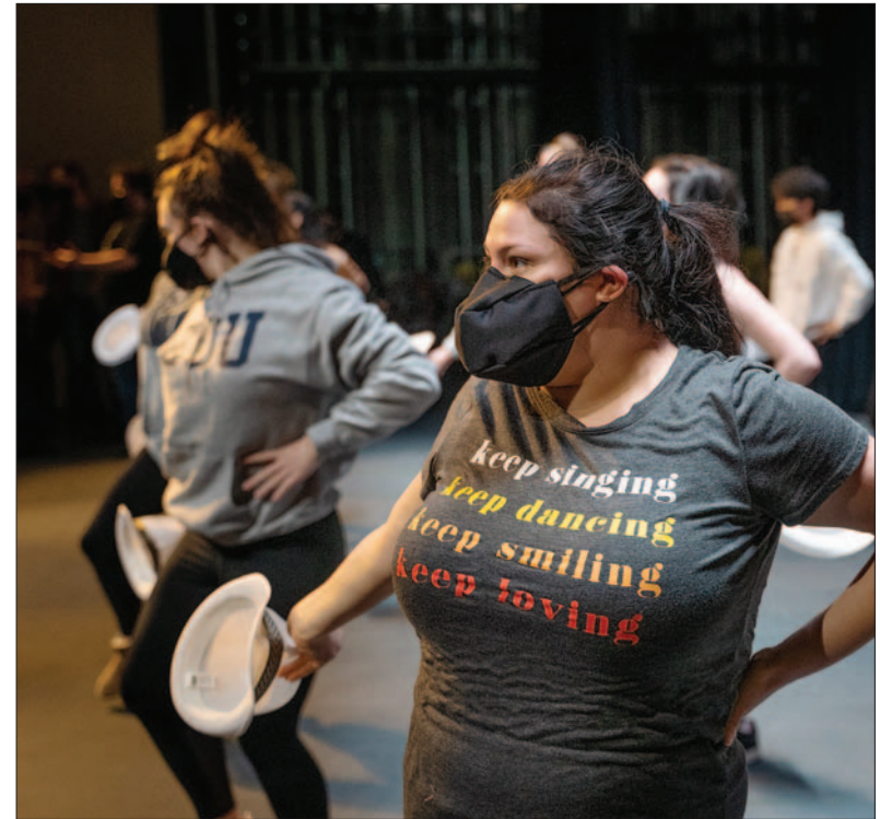
EOU students rehearse "We've Got Your Number" on Jan. 26, 2022. Performances are set for Feb. 25 and 26 at McKenzie Theatre.

The decision was made to postpone the production to