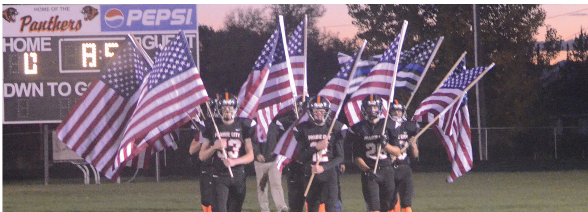
Prairie City's football team honored the flag ahead of its homecoming game on Friday, Oct. 8, 2021. The flag ceremony became a tradition after the Panthers walked out with the stars and stripes to honor men and women in the military who were killed in Afghanistan in late August, and later expanded it to commemorate law enforcement and first responders.