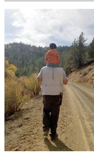
Contributed photo Father and son enjoying a fall day on South Fork.