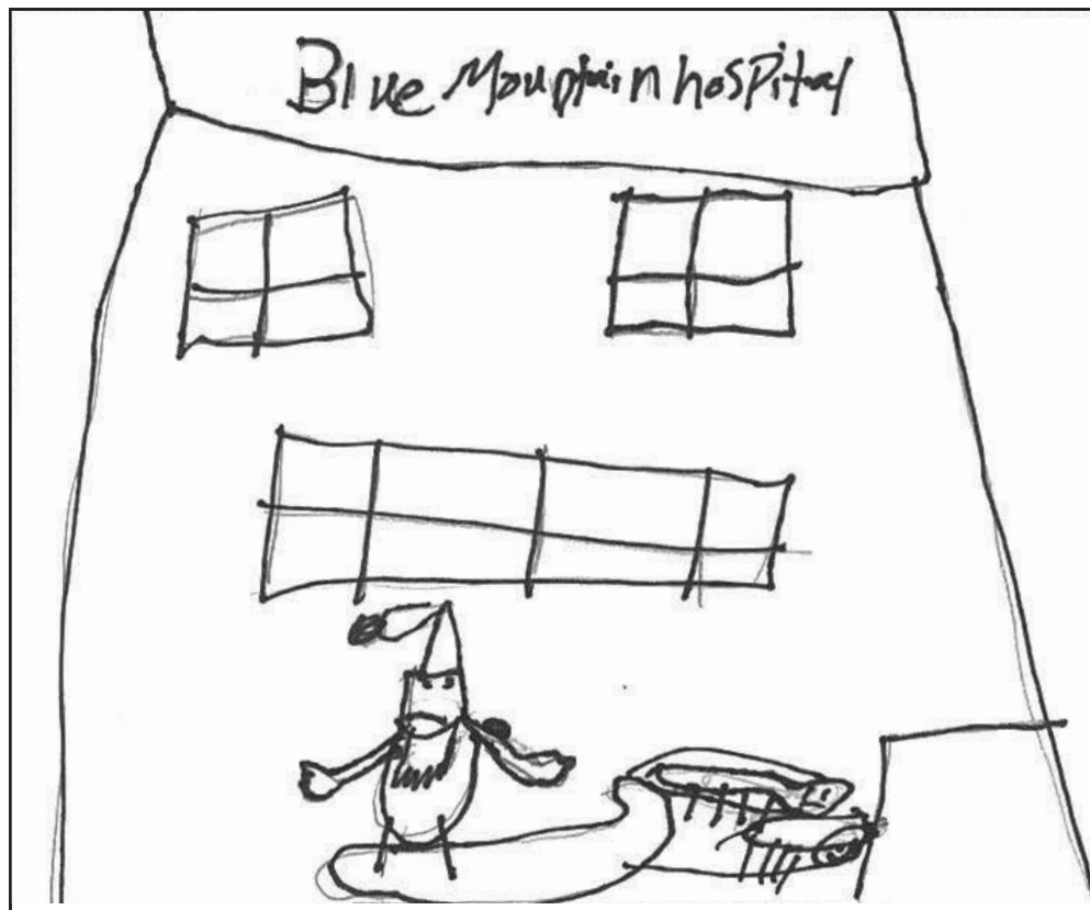
Paige Hicks • 5th grade • Prairie City Elementary