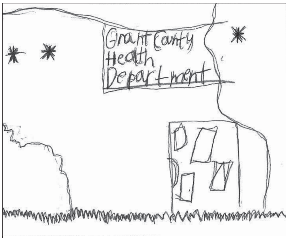
London Sharpe • 5th grade • Humbolt Elementary