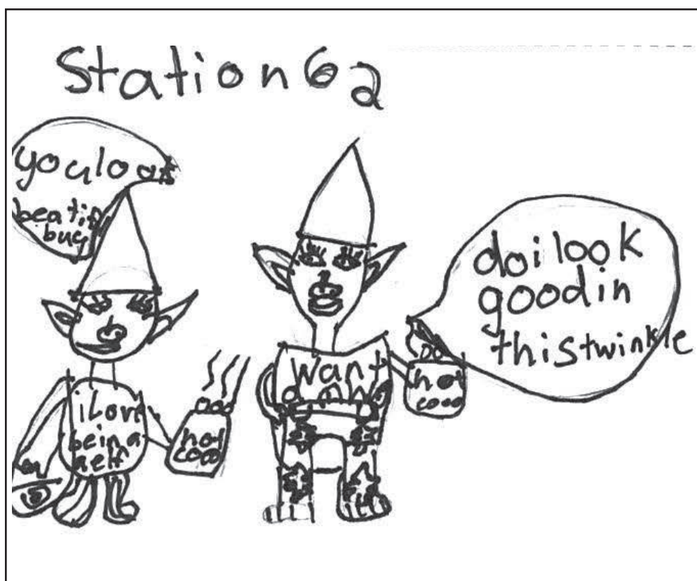
Paislee • 4th grade • Humbolt Elementary