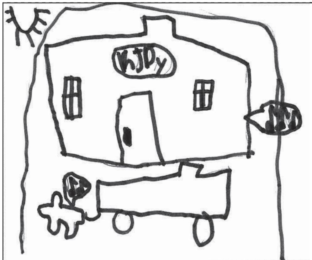
Hunter McQuown • 2nd grade • Humbolt Elementary