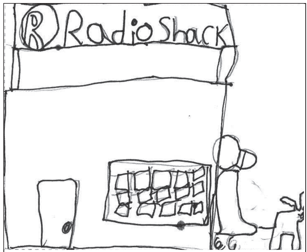
Drayden * 4th grade * Humbolt Elementary