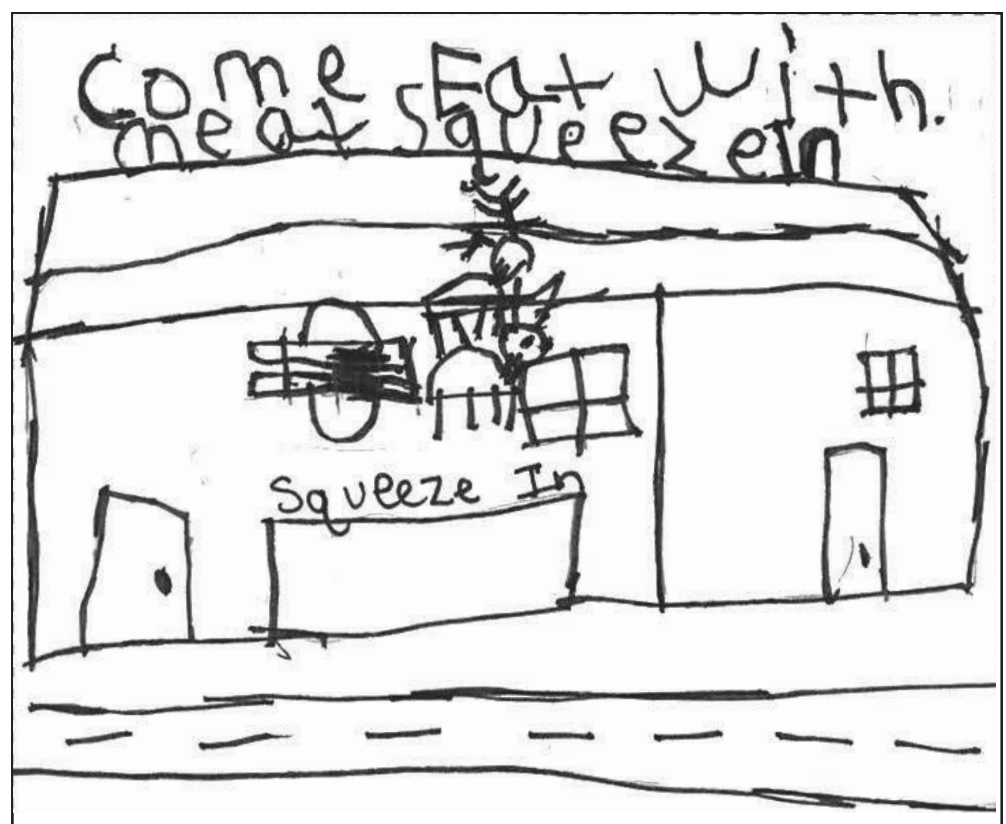
Wyatt Simmons * 3rd grade * Humbolt Elementary