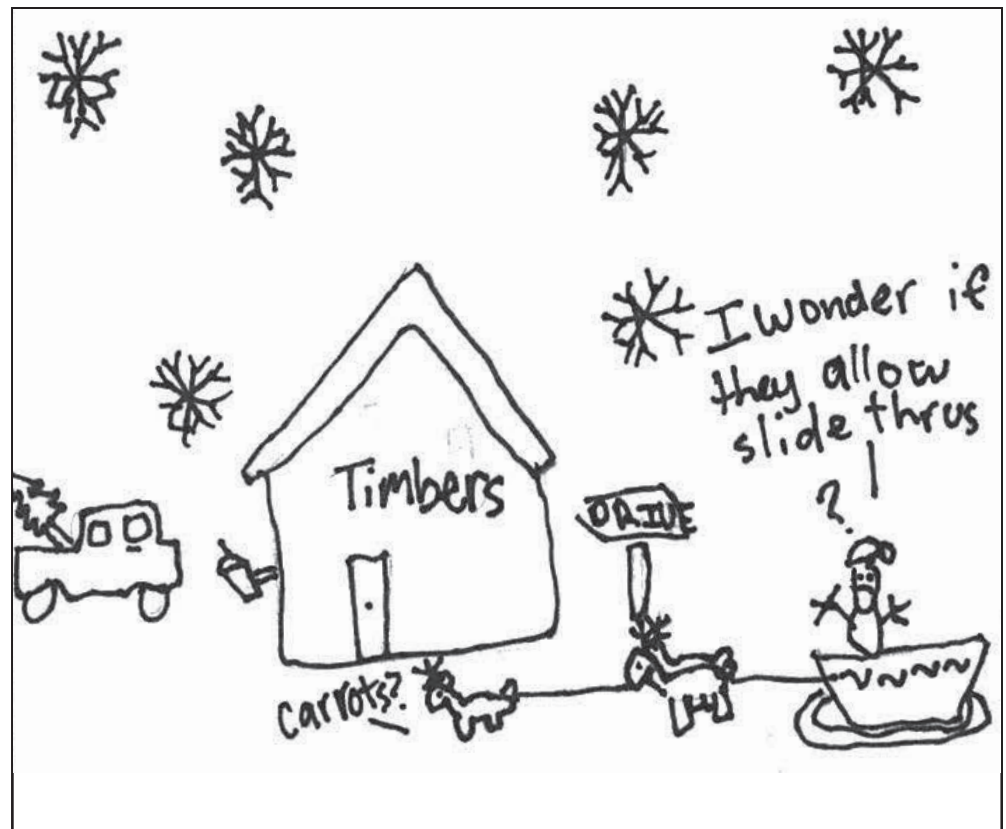
Allison * 4th grade * Humbolt Elementary