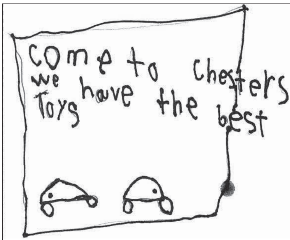
Ryder * 2nd grade * Humbolt Elementary