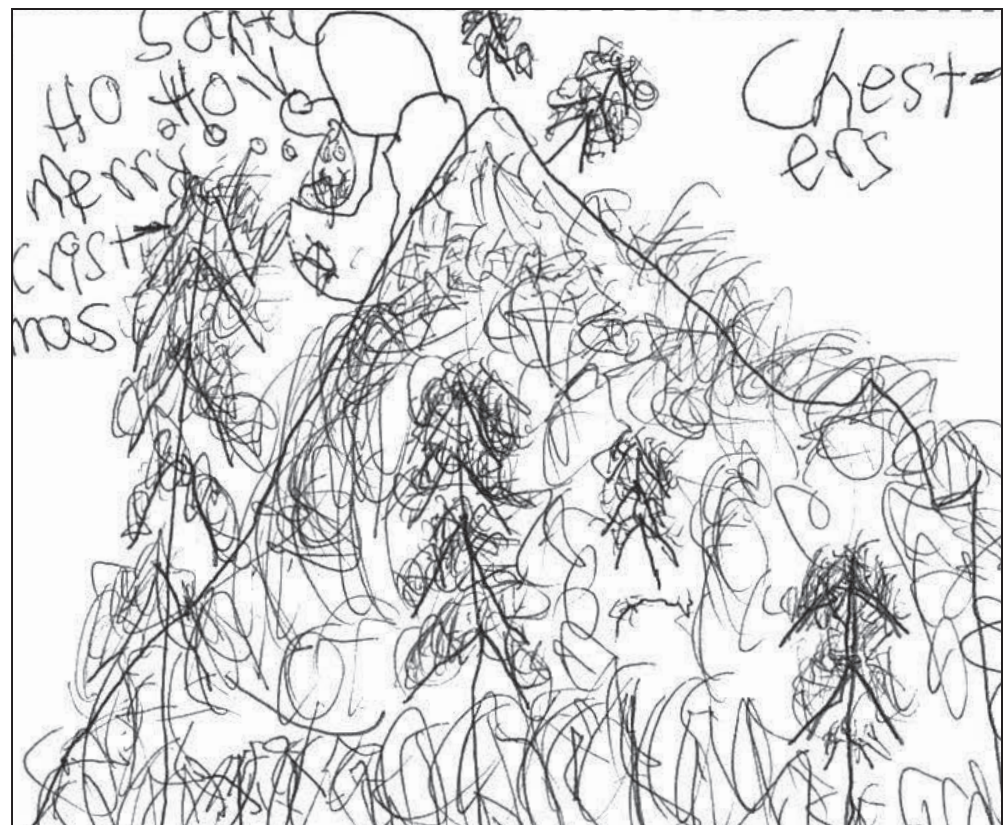
Dallas Day • 5th grade • Humbolt Elementary