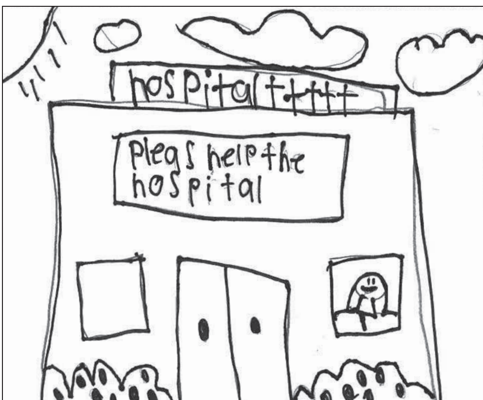
Penelope • 2nd grade • Humbolt Elementary