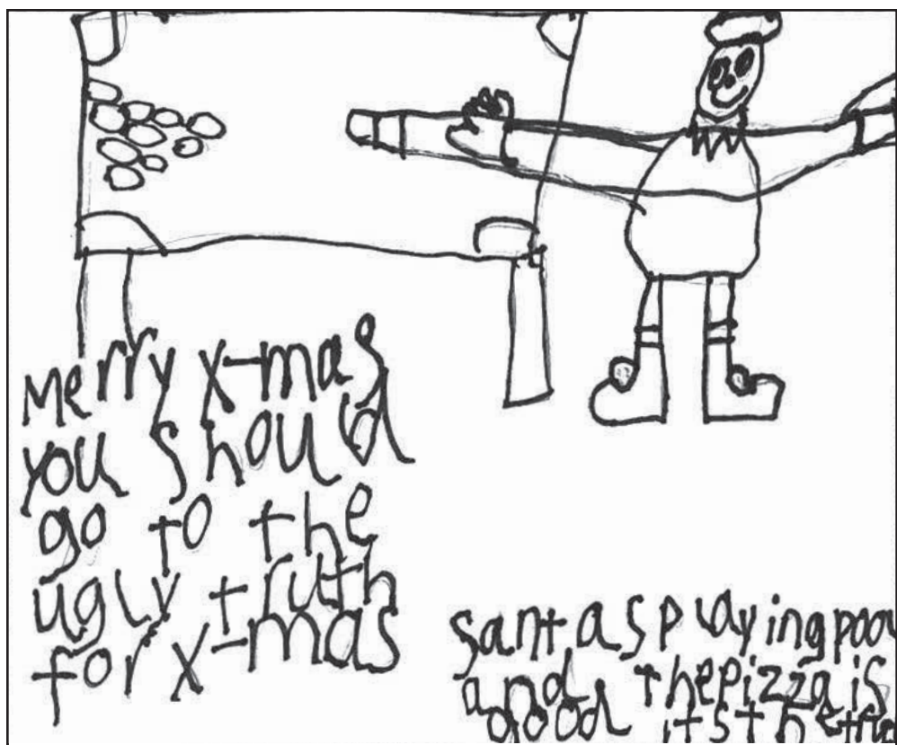
Trig • 4th grade • Humbolt Elementary