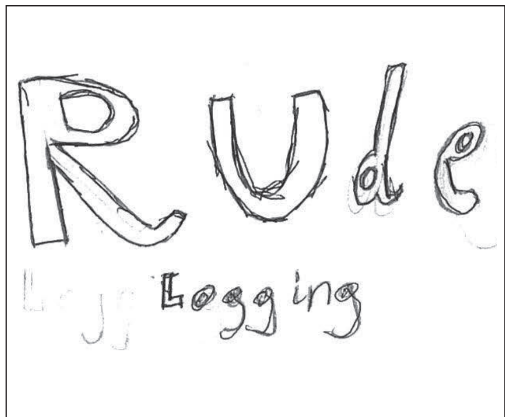
Colton • 5th grade • Humbolt Elementary