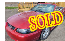
2003 MUSTANG- V6, Convertible, Only 32k Miles!