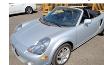
2003 Toyota MR-2 Spyder