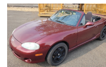
2003 Mazda Miata 31k original miles!