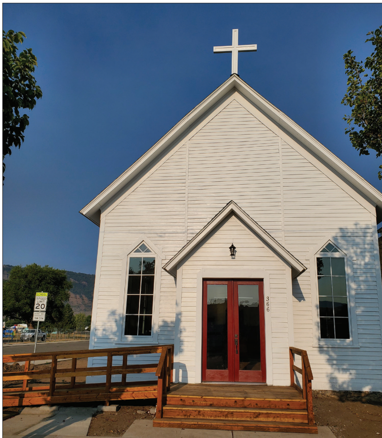
Union's Little White Church, owned by the Union County Museum, is available for weddings and events.