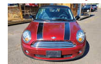
2008 MINI COOPER- Leather, Auto, Only 32k Miles!