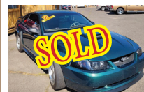
2001 MUSTANG- V8, Leather, Stick Shift, Stage 1 Build!