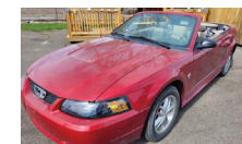
2003 MUSTANG- V6, Convertible, Only 32k Miles!