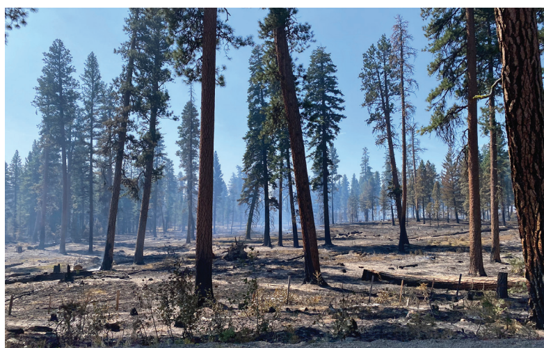
Post-fire smoldering after the Black Butte Fire near Forest Road 16.

All boundary roads will remain open except FSR 16 will be closed from the junction of FSR 1663 and FSR 16 to the junction with FSR 1675, continuing south on FSR 1675 to the junction of FSR 423.