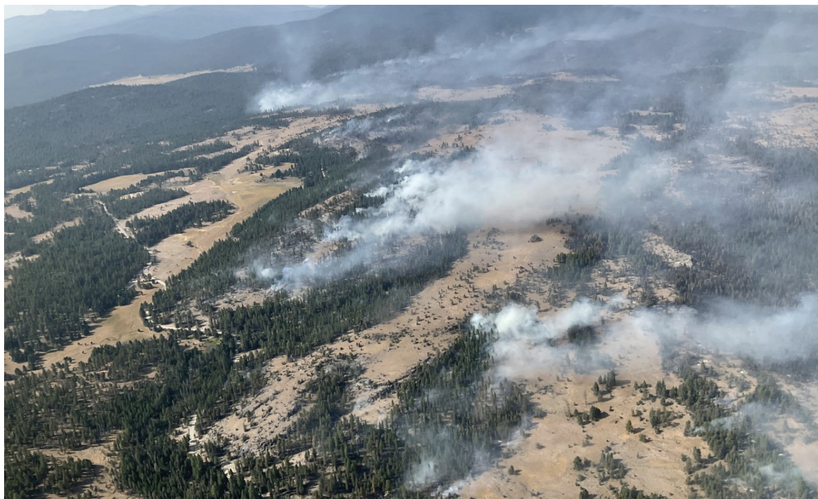
An aerial view of the Black Butte Fire.

The closure area consists of all geographical areas on Forest Service land within boundaries of the following description: Starting at the intersection of Forest Service Road (FSR) 16 and FSR 1675 at T. 15 S, R. 35.5 E, Sec. 26, south on FSR 16 to the junction of FSR 16 and FSR 1663 at T. 16 S, R. 35 E, Sec. 19, south on FSR 1663 to junction of FSR 1663495 at T. 17 S, R. 35.5 E, Sec. 28, south along FSR 1663495 to the junction of FSR 1663495 and FSR 1663496 at T. 17 S, R. 35.5 E, Sec. 27, south on FSR 1663496 to the junction of FSR 1663 at T. 17 S, R. 35.5 E, Sec. 34 continue south on FSR 1663 until it intersects with Tamarack Creek at T17 S, R. 35.5 E, Sec. 3 southeast along Tamarack Creek to the Malheur National Forest boundary at T. 18 S, R. 36 E, Sec. 12. Fol-