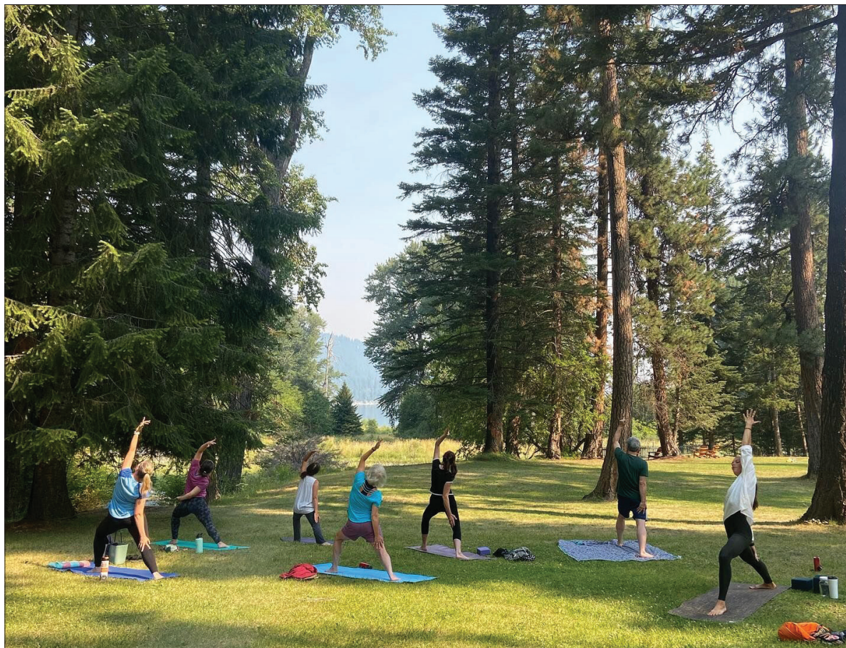
www.facebook.com/WallowaLakeLodge Summer Sundays feature yoga on the lawn at Wallowa Lake Lodge.

Once regulations were sorted out, Lau said the board and staff decided to keep the lodge and restaurant open, but reduced the number of diners from a capacity of 84 to 42.