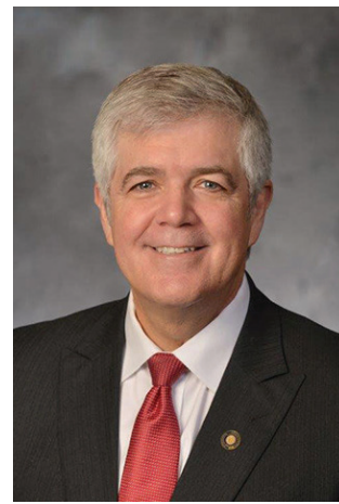
Rep. Cliff Bentz, R-Ontario, will hold his first in-person town hall meeting with voters in Grant County Thursday at Mt. Vernon's Community Hall.

The press release notes that Oregon recommends wearing masks in public and indoor settings regardless of vaccination status.