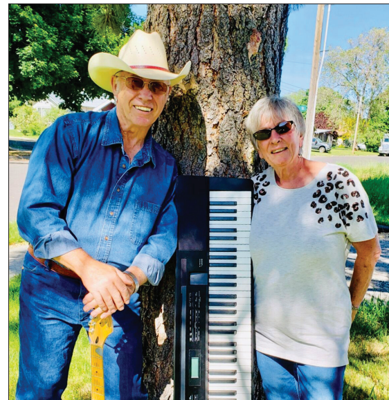
Barefoot & Bonafide plays Saturday, July 31, in Baker City.

Hermiston-based Brass Fire plays jazz, funk, blues, rock and swing in the Eastern Oregon