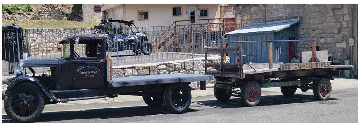
The Whiskey Gulch Gang's 1929 Model AA truck.