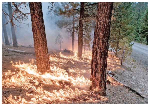
Fire burns along the ground in the Soda Bear prescribed fire area in 2019.

Additional information is available on InciWeb at https://inciweb.nwcg.gov/incident/7426 . For more information, call 541-575-3000.