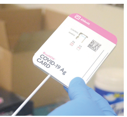
A Grant County Health Department staff member reviews a COVID-19 rapid test.

Counties will not be put in the extreme risk level regardless of their own COVID-19 numbers if the state overall has under