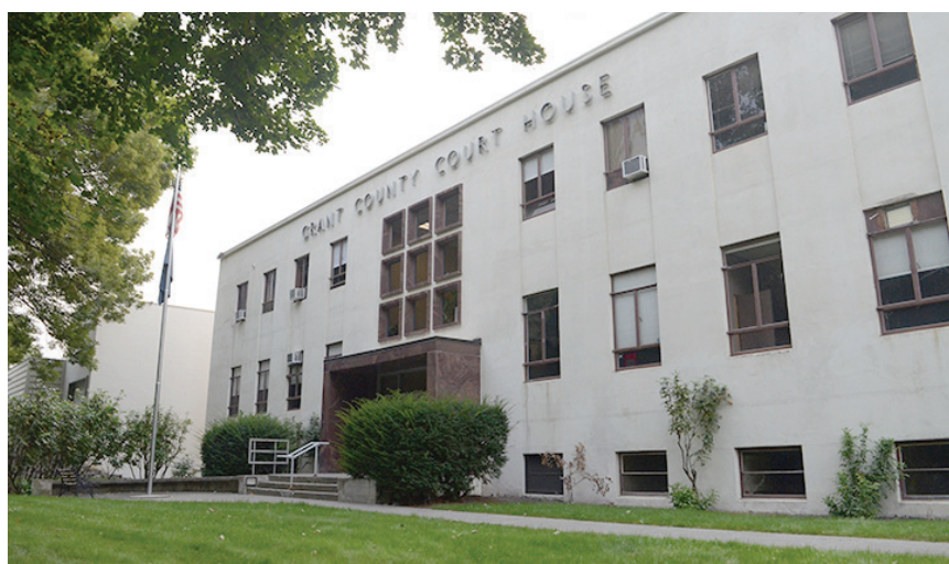
The Grant County Courthouse on Sept. 15.

"The Grant County Circuit Court remains open to the public for all matters including filings for civil matters, emergency hearings to protect citizens and any other matter," Raschio said. "The staff is prepared and