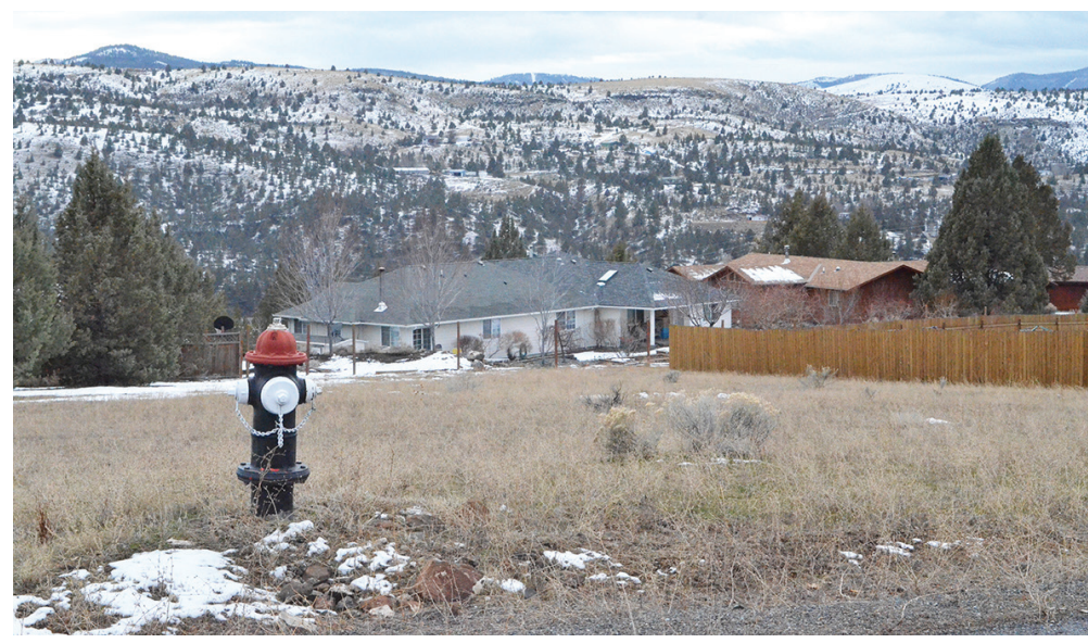
The city of John Day is asking Grant County to form a partnership to spur growth in the area.