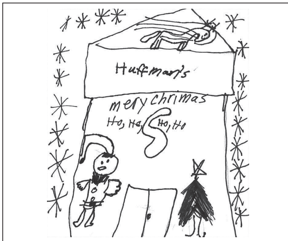
Paige Hicks • 4th grade, Prairie City Elementary