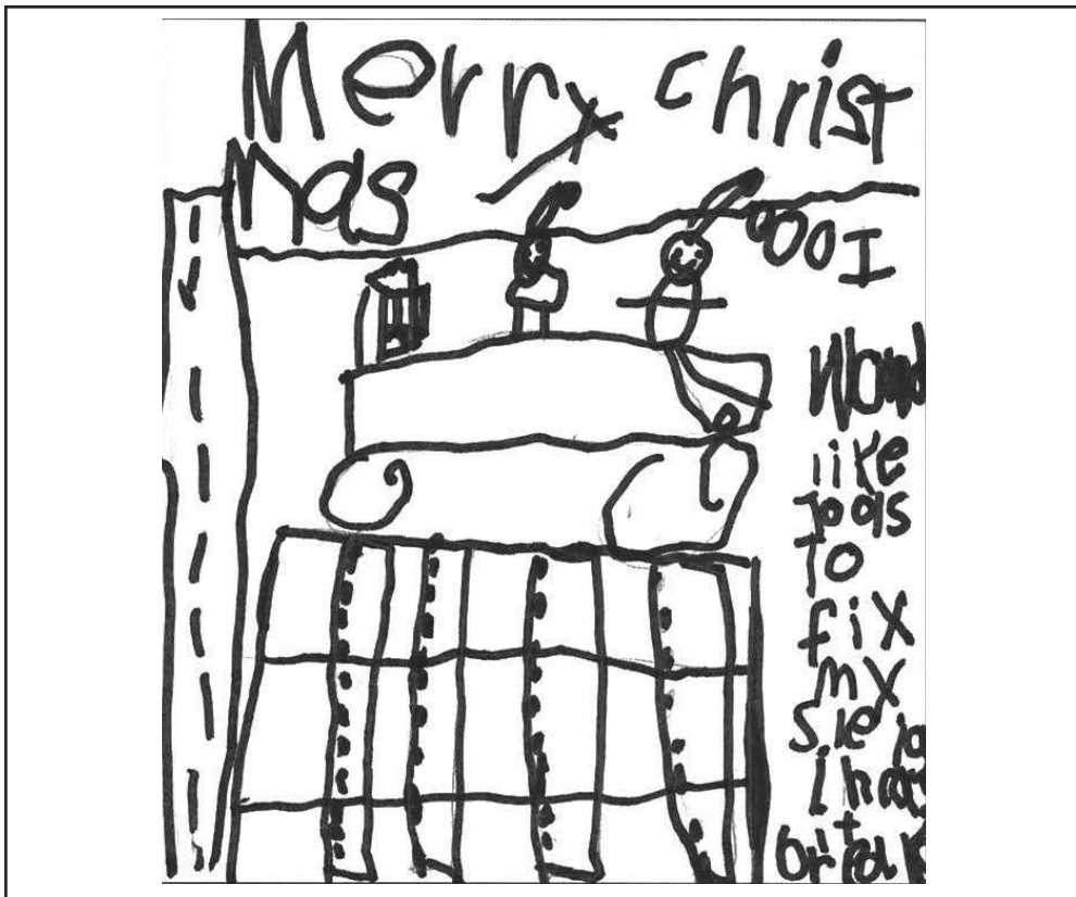
Tracker Mclead • 2nd grade, Humbolt Elementary