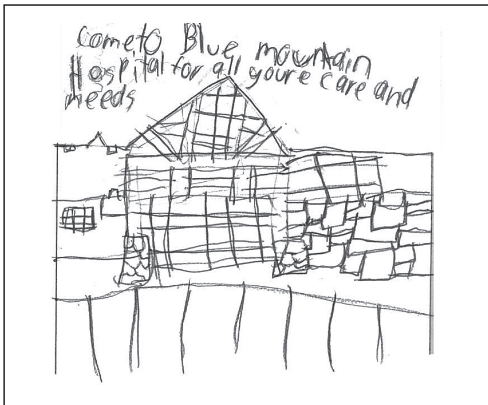
Syntheia • 6th Grade, Prairie City Elementary