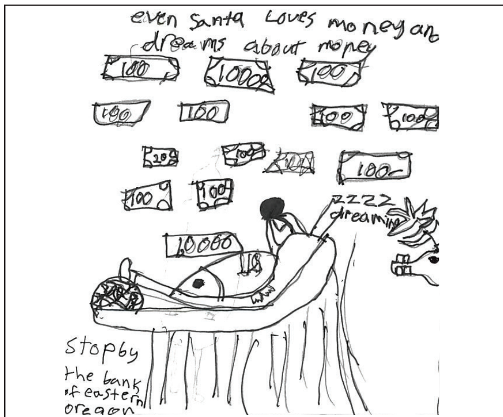
Jack Knowles • 5th grade, Humbolt Elementary