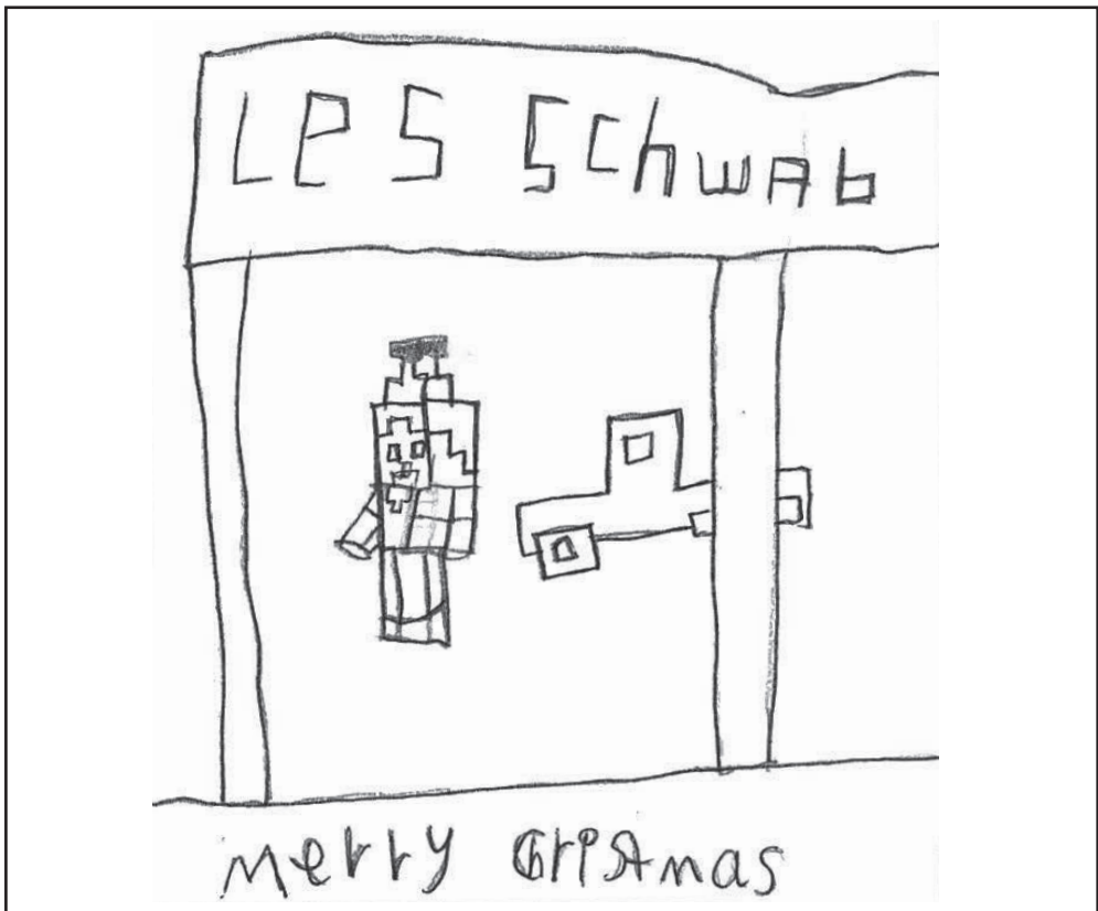
Oden Elliott • 5th Grade, Humbolt Elementary