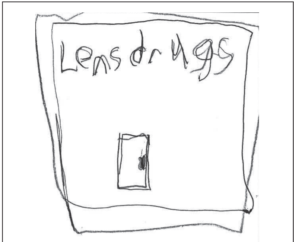
Tristen • 5th grade, Humbolt Elementary