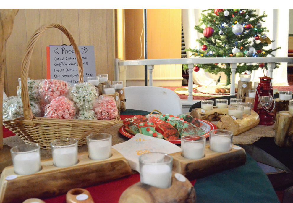
The Eagle/Rudy Diaz