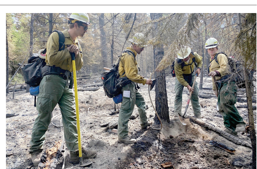
Firefighters from a Umatilla National Forest Type 6 engine dig up and extinguish remaining hot spots along the line of the Matlock Fire.

The John Day Interagency Dispatch Center reported Monday that resources contained a small fire, Elk Creek. The main source of fuel was the burning of a log, the dispatch center reported.