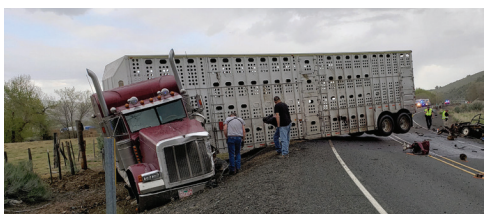
A 56-year-old Sheridan man died in a collision on Highway 26 Saturday near Mt. Vernon.

The CARES Act page also provides information for self-employed, contract, gig, and other PUA-eligible workers who filed regular claims for unemployment benefits prior to the start of the program.