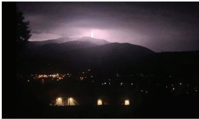
Lightning over John Day and Canyon Mountain April 29.