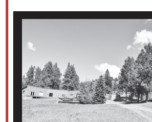
234 Ac. in Ritter ~ 7k grid-tied solar! Custom built sanctuary with 3/3 home, shop, office with apt., creek, timber, large garden with fruit trees. Views! $749,900

541-934-2946 Office 541-519-6891 Cell 41909 Copper Creek Rd. Kimberly OR 97848 Follow us on facebook!