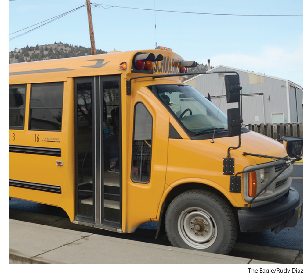
Workers in a bus delivering school work packets April 1 wore face masks and gloves while handing out materials.

Schools and staff have also been heavily focused on students' well-being. Schools are working hard to have weekly contact with students, whether it be via