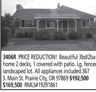
3406R PRICE REDUCTION! Beautiful 3bd/2ba home 2 decks, 1 covered with patio. Lg. fenced/landscaped lot. All appliances included. 367 S. Main St. Prairie City, OR 97869 $192,500 $169,500 RMLS#19291861