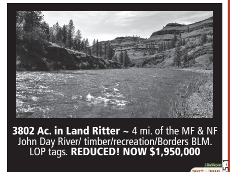
3802 Ac. in Land Ritter ~ 4 mi. of the MF & NF John Day River/ timber/recreation/Borders BLM. LOP tags. REDUCED! NOW $1,950,000

SOLD! 370 Acres Land on Wall Creek Rd ~ Borders BLM with 2 springs. Rock quarry lease with county. $248,000 SOLD! 661 Acres in Monument ~ Mountain retreat with cabin, outbuildings, views, timber, creek, BLM access. $848,000. 274 Ac. in Heppner ~ on McDaniel Creek with springs, pond, timber. Older cabin not livable. Pole barn. $349,000. Terms. PENDING! 585 Ac. on over 1 mile of NFJD River in Ritter ~ Off grid, private, seasonal creeks, borders BLM. $495,000 234 Ac. in Ritter ~ 7K grid-tied solar! Custom built sanctuary with 3/3 home, shop, office with apt., creek, timber, large garden with fruit trees. Views! $749,900. 296 Ac in Kimberly ~ Irrigated land w/pivots, NFJD river frontage, large shop, hay storage, covered cattle facilities, corrals, views of valley. REDUCED TO $975,000.